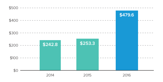
YEAR-END CASH* (IN MILLIONS)

Our cabozantinib partnerships are not limited to commercialization; Ipsen and Takeda participate in cabozantinib's clinical development and will leverage emerging datasets as we build a franchise in RCC and additional indications. Following positive results from the CABOSUN phase 2 randomized trial, we are preparing a supplemental New Drug Application for cabozantinib as a treatment for patients with previously untreated RCC, which we plan to submit in the third quarter of this year. In addition, CELESTIAL, the global phase 3 pivotal trial of cabozantinib versus placebo in second-line advanced hepatocellular cancer (HCC) continues to enroll, with data expected in 2017.